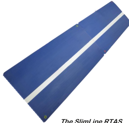
The SlimLine RTAS

Complete race timing antenna system – for deployments of up to 7 antennas