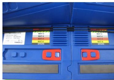
Integrated cable channels & Inter-connecting straps