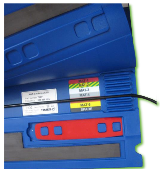
Integrated cable channels – Cable detail

Event and race-proven, the SlimLine RTAS has been extensively stress and performance-tested in hundreds of events around the world, putting this complete race timing antenna system in a class of its own.